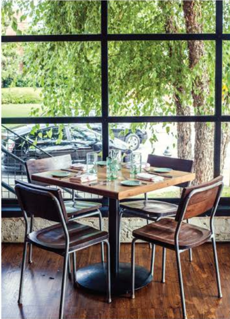
Semi-private for 49 guests or less